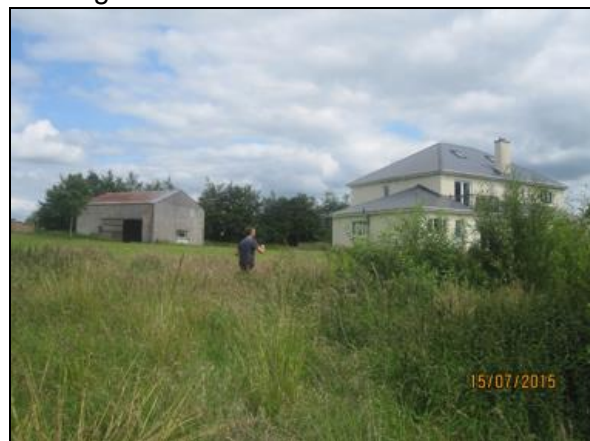
A new dwelling house is built in the centre of the site close to the shaft.