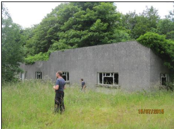
The former Administration Block is now derelict.