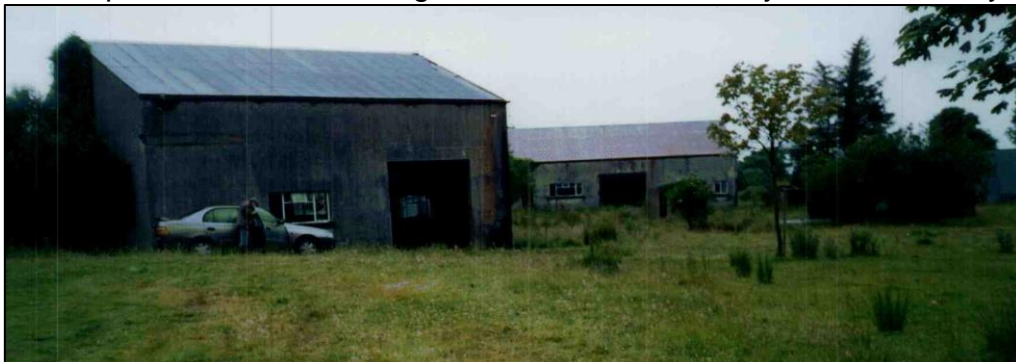
The winding house and mechanical workshop beyond taken in 2002.