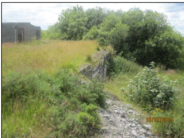
Workshops and a crude timber wall and platform for loading onto lorries.