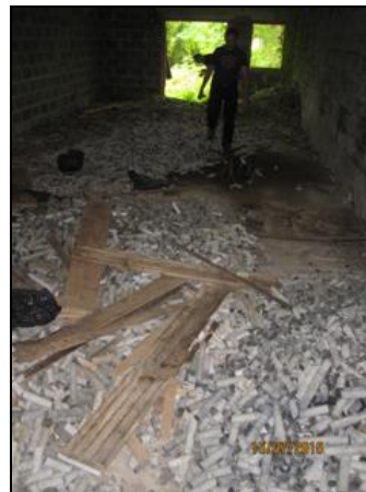
Long abandoned drill core inside a shed is now just a reminder.