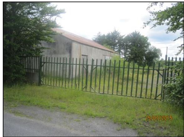
From the roadside alongside the Keel Mine site, mine workshops are now farm buildings.