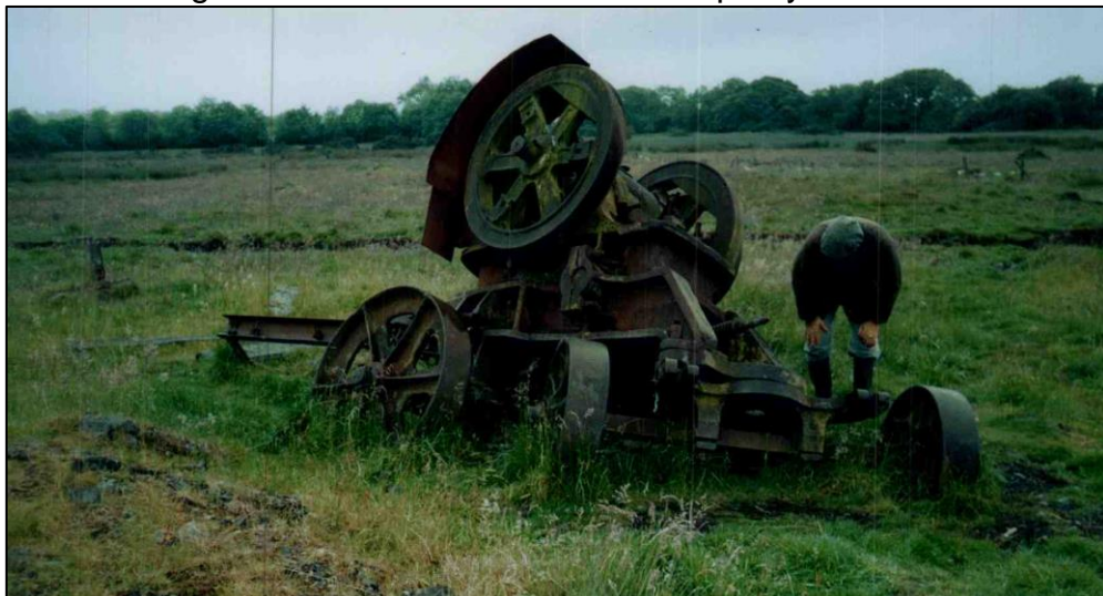
The portable jaw crusher taken in 2002, now in the forestry.