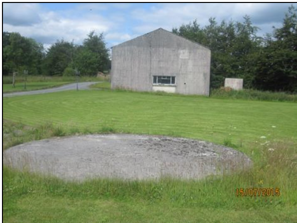
The former hoist house with the capped shaft in the foreground.