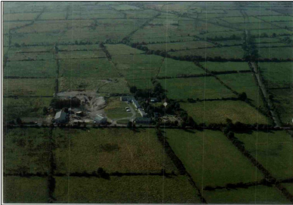
Aerial photo of the site during the late 1960s, taken by Charles Morley.

Historical pictures of Keel Mine site reproduced from the Historic Mine Records of the Geological Survey of Ireland, and in Lally, P. 2002. Salvaging minesites – the case of Keel. Journal of the Mining Heritage Trust of Ireland 2 , 3-7.