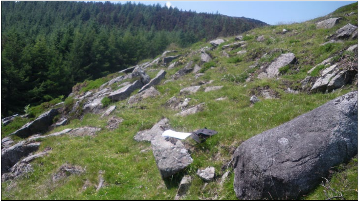
General view of the site, looking west.