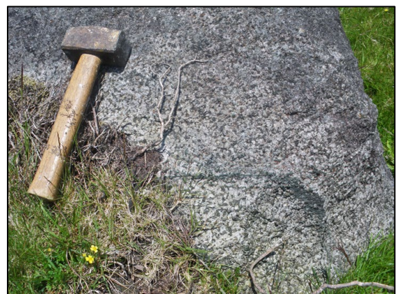
Brecciation of gabbro, net-veins of granite and an area of hybridized gabbro (H) appearing to merge with an acid vein on its left (coin 24mm in diameter) (left). Black and white, relatively coarse-grained "speckled" gabbro hybrid (right)