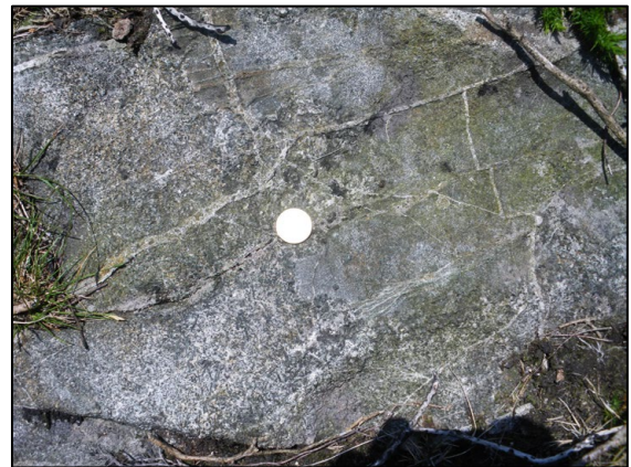
Gabbro net-veined by granite (left). Closer view (right) shows thin veinlets and diffuse areas of altered gabbro (coin is 24mm in diameter).