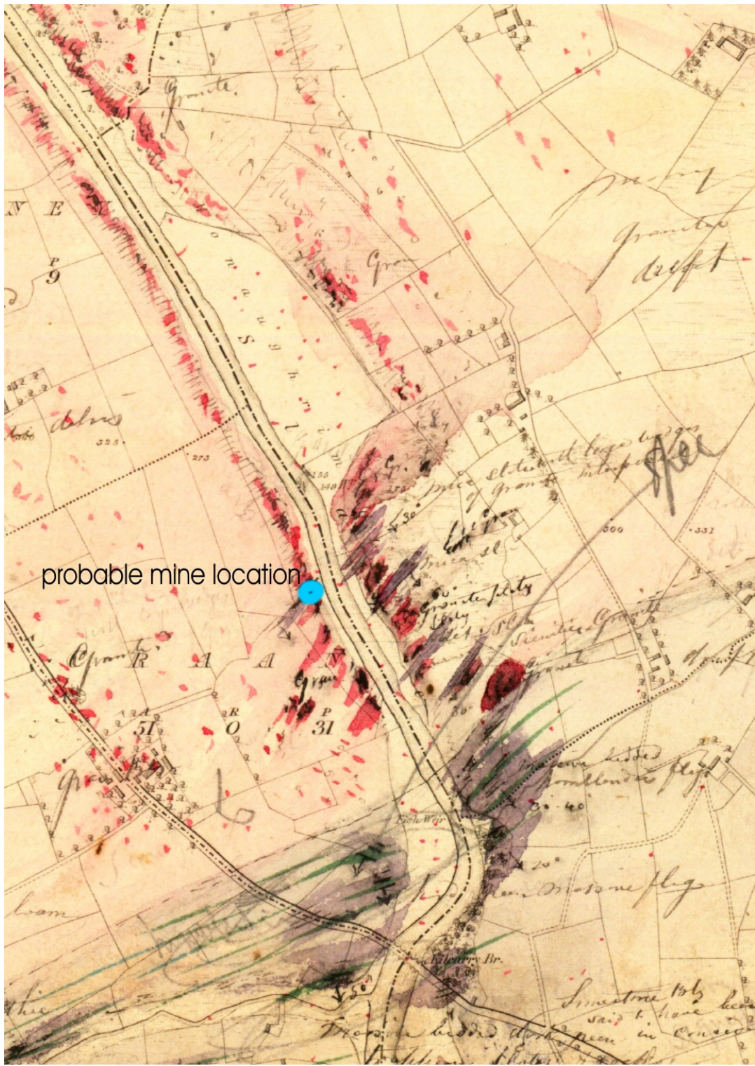
Enlarged extract of GSI 6 inch to the mile 19 th century fieldsheet, showing probable mine location within the granite outcrop (coloured pinky red), where granite and schists (coloured purple) are intermixed.