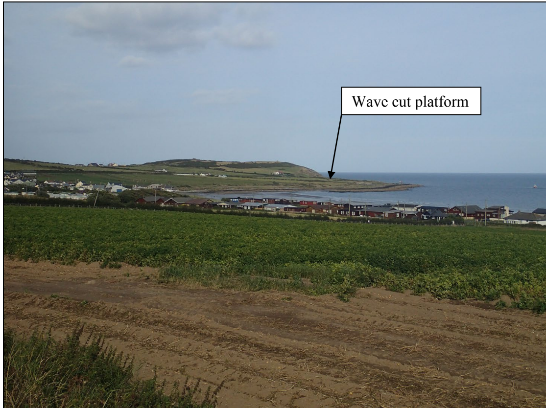
View northeastwards from Glaspistol, towards Clogherhead. See the wave cut platform on the southern side of the headland.