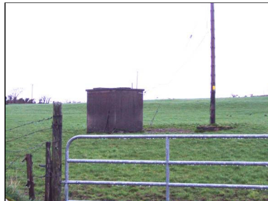
Left: Schematic drawing showing the dynamics of an artesian well. Right: Structure housing the artesian well.