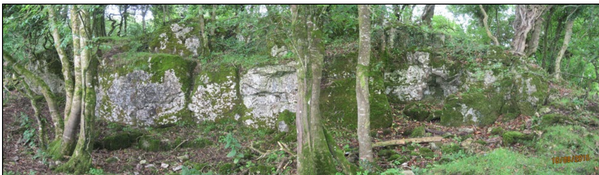
The Waulsortian mudmound exposed in the rocky knoll to the north of the quarry at Creeve.