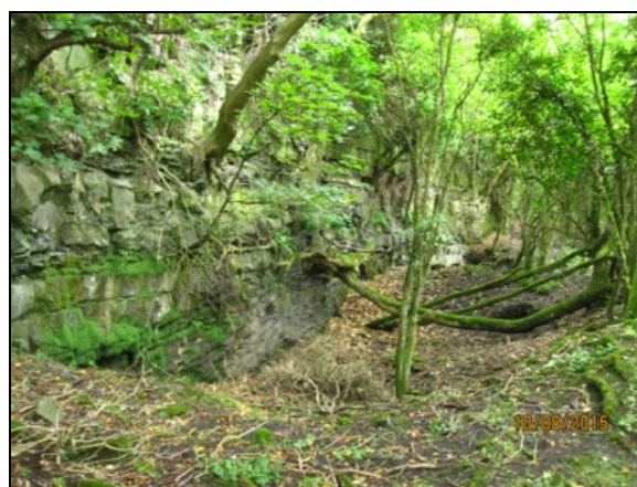
The main quarry face exposed in the quarry at Creeve, looking south.