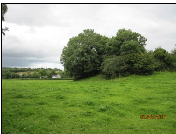
The wooded knoll with Waulsortian mudmound north of the quarry at Creeve.